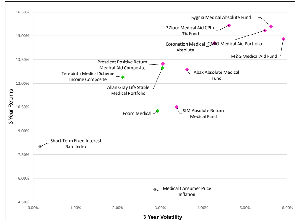
Volatility-Return Scatterplot of Medical Aid Managers - Absolute Return and Balanced for 3 Years ended 28 February 2026