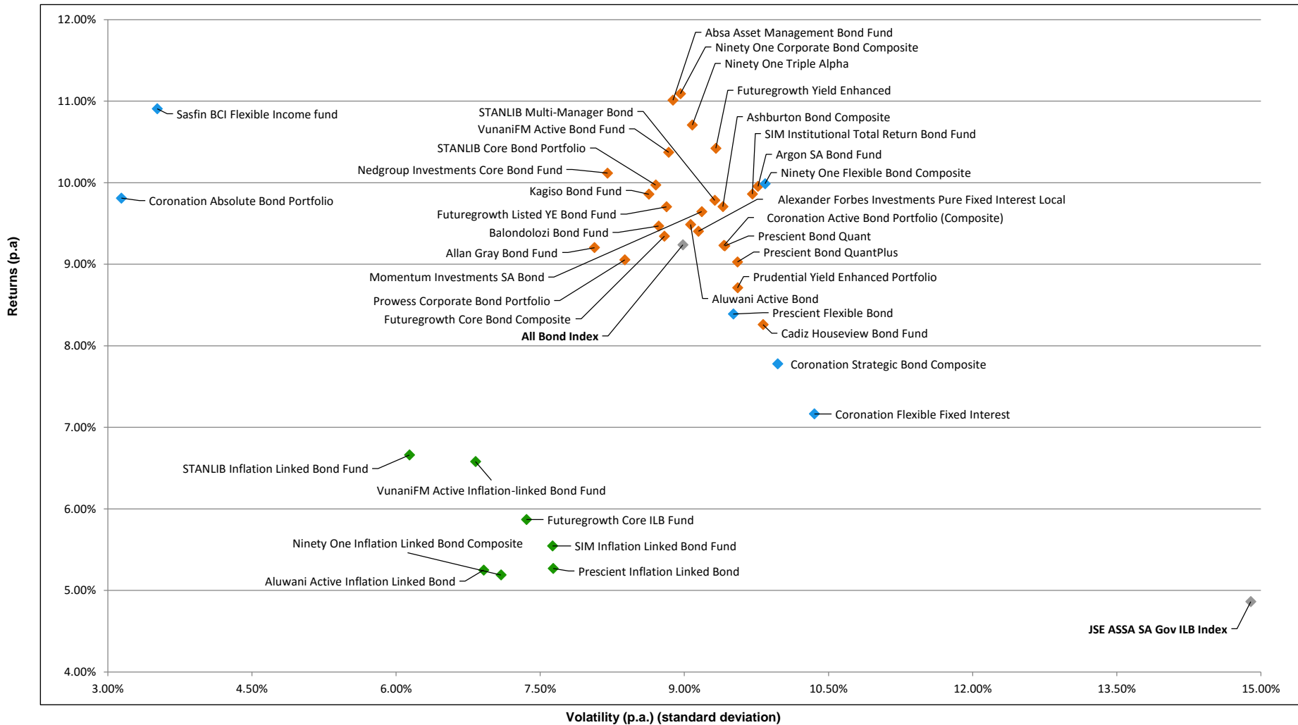
Volatility vs Return scatterplot – SA Bond Managers 3 Years ended 30 Jun 2021