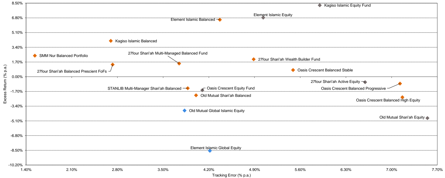
Excess Return vs Tracking Error Scatterplot - Shariah Compliant Portfolios - Balanced and Equity mandates 3 Years ended 30 April 2019