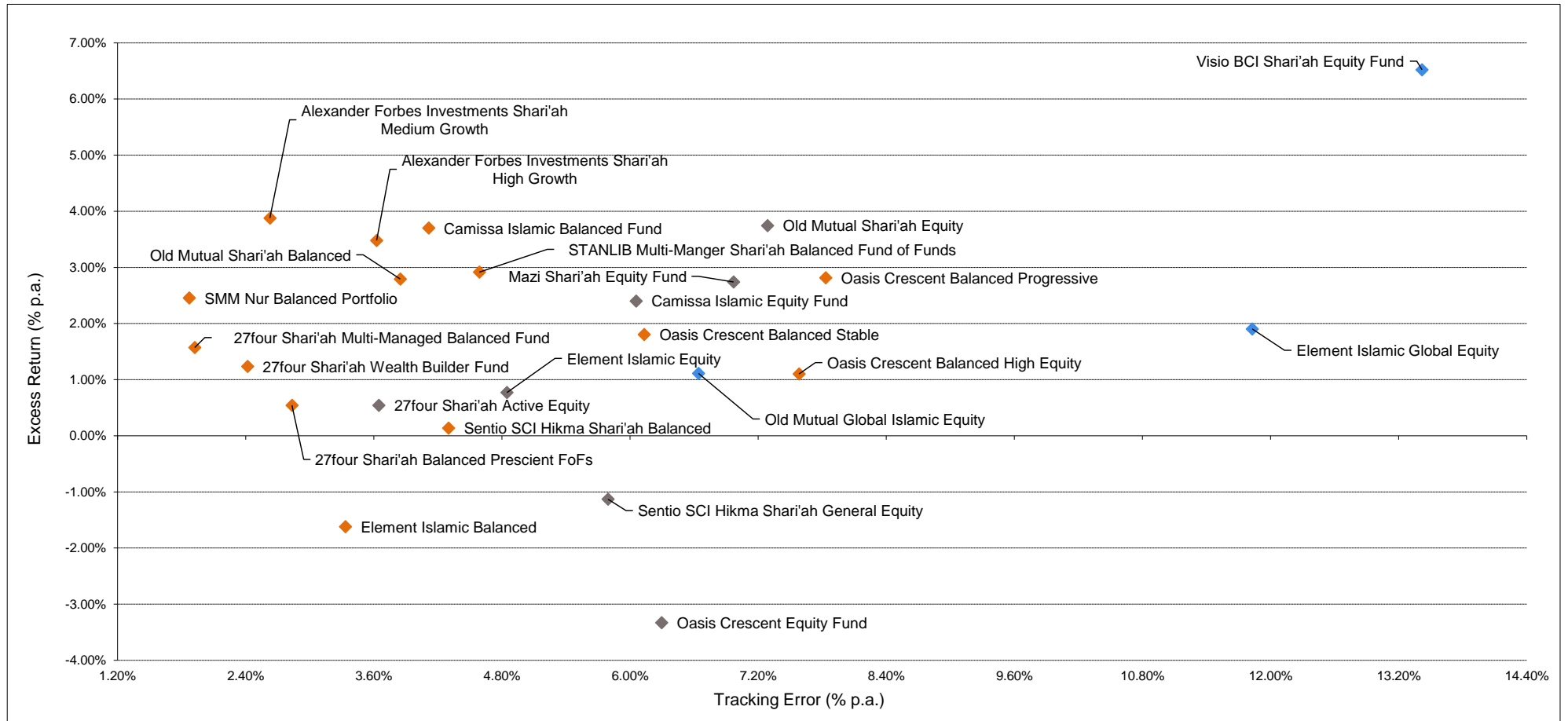
Excess Return vs Tracking Error Scatterplot - Shariah Compliant Portfolios - Balanced and Equity mandates 3 Years ended 31 July 2023