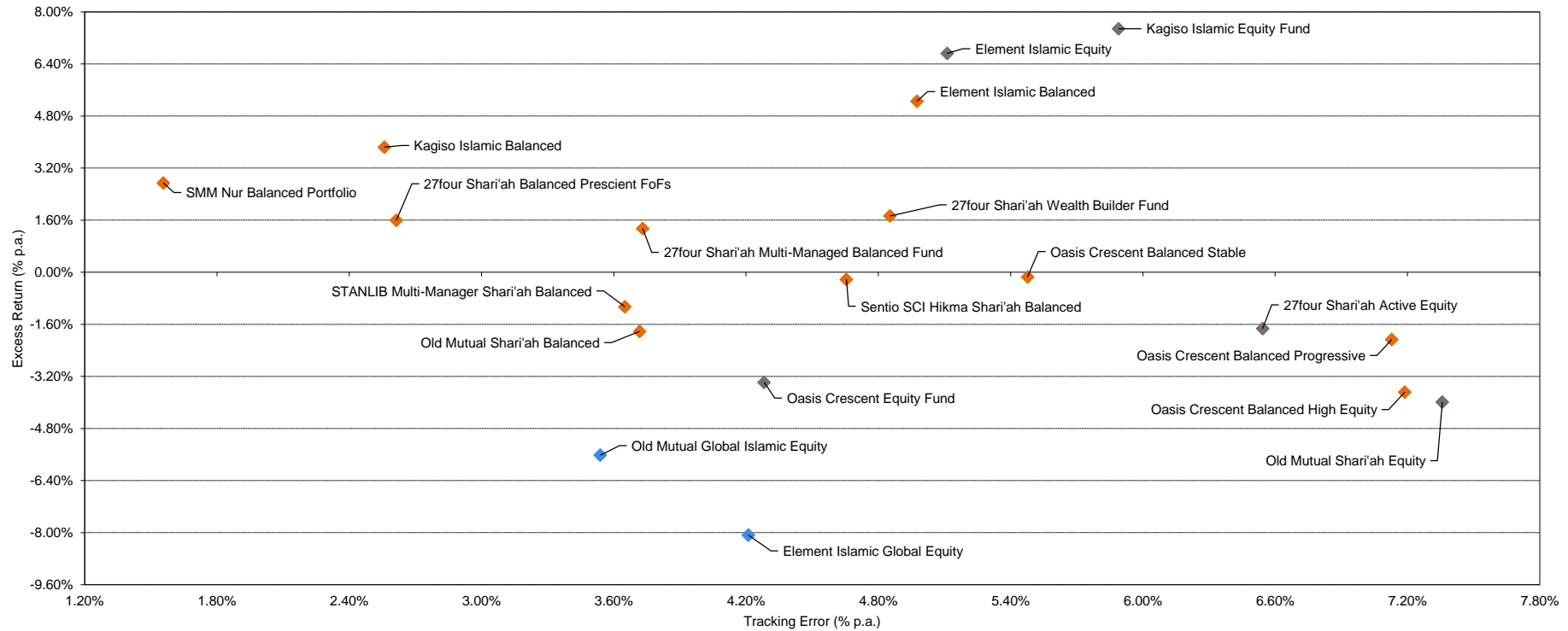
Excess Return vs Tracking Error Scatterplot - Shariah Compliant Portfolios - Balanced and Equity mandates 3 Years ended 30 June 2019