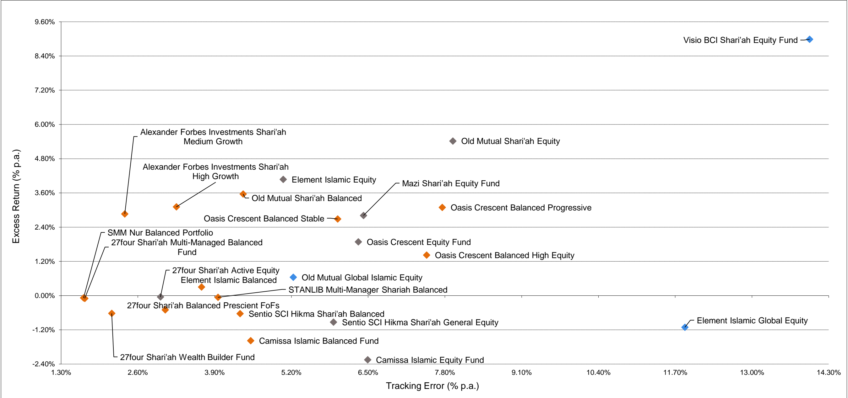
Excess Return vs Tracking Error Scatterplot - Shariah Compliant Portfolios - Balanced and Equity mandates 3 Years ended 30 June 2024