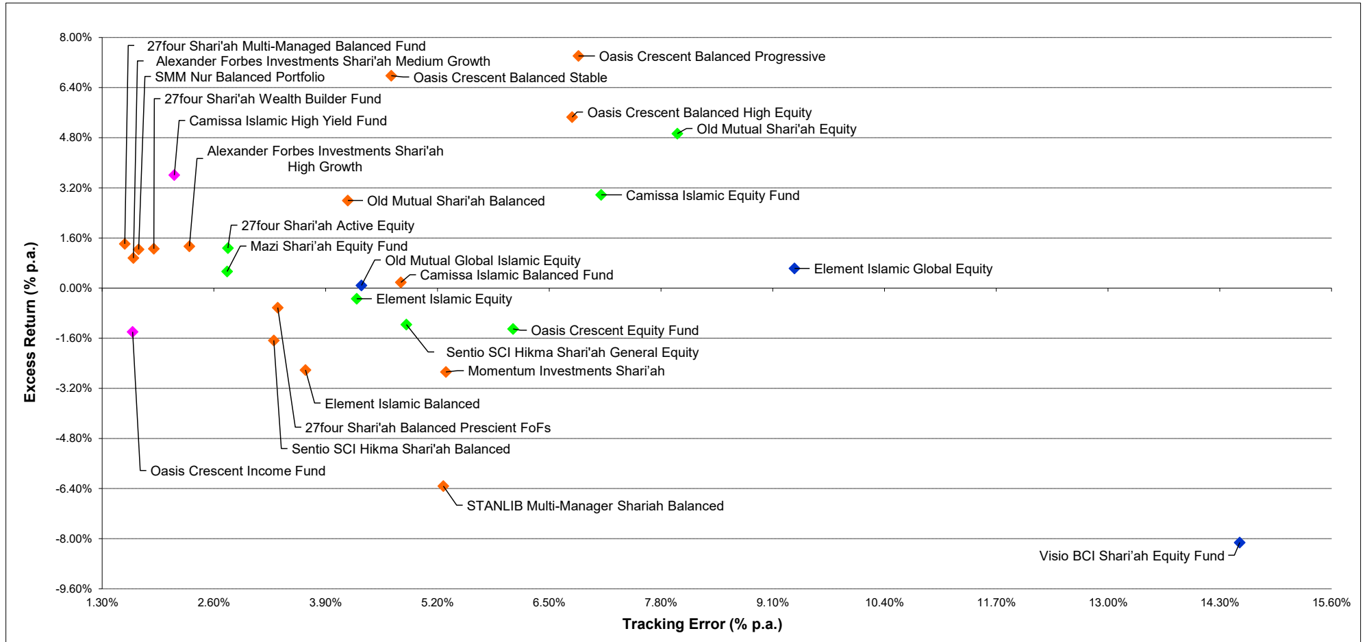
Excess Return vs Tracking Error Scatterplot - Shariah Compliant Portfolios Balanced, Equity and Income Funds 3 Years ended 31 March 2026