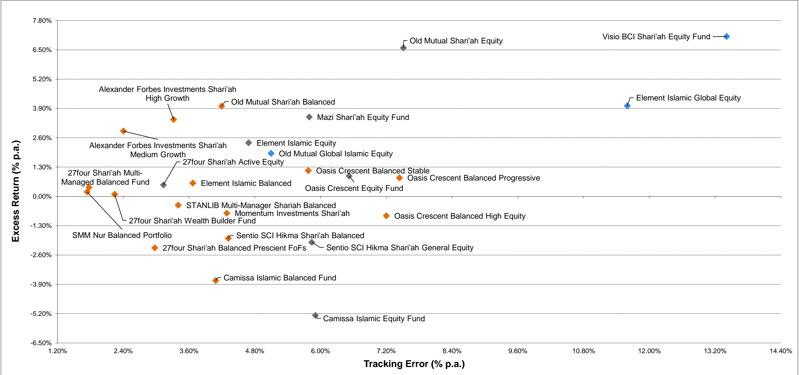
Excess Return vs Tracking Error Scatterplot - Shariah Compliant Portfolios - Balanced and Equity mandates 3 Years ended 31 October 2024