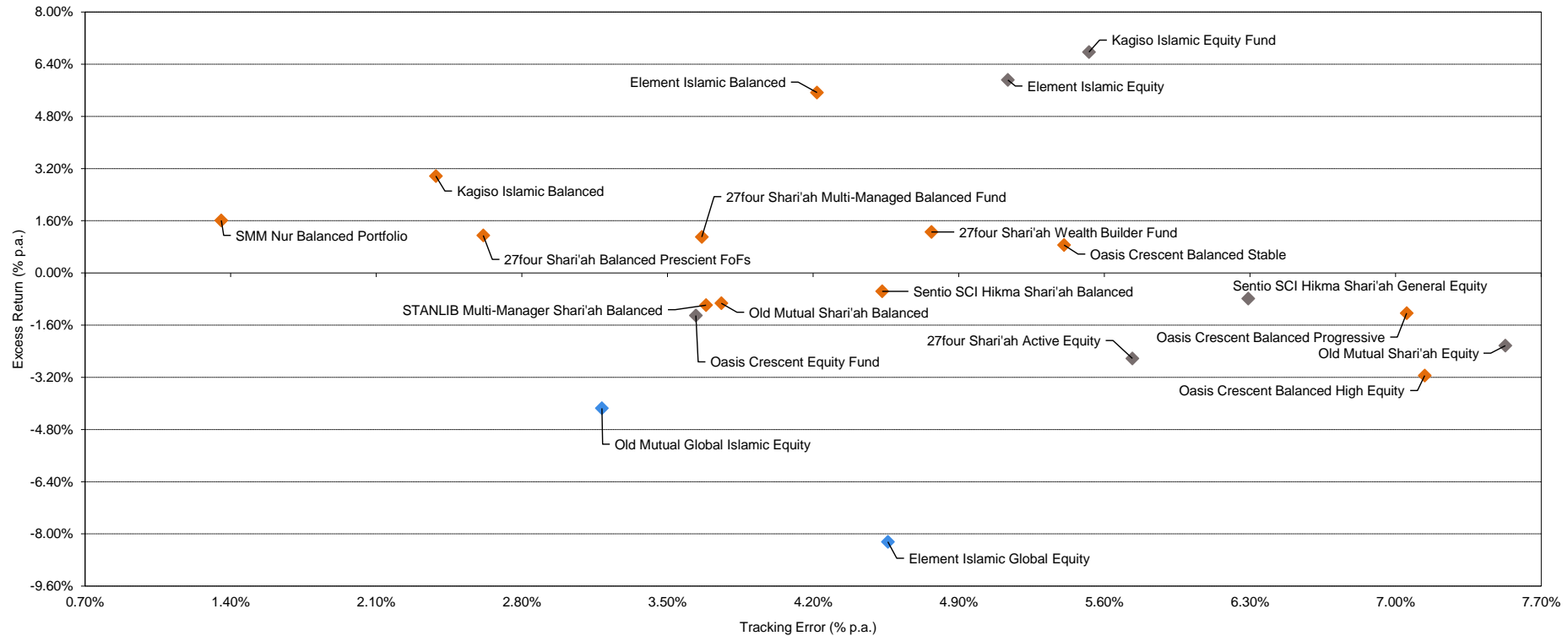
Excess Return vs Tracking Error Scatterplot - Shariah Compliant Portfolios - Balanced and Equity mandates 3 Years ended 30 September 2019