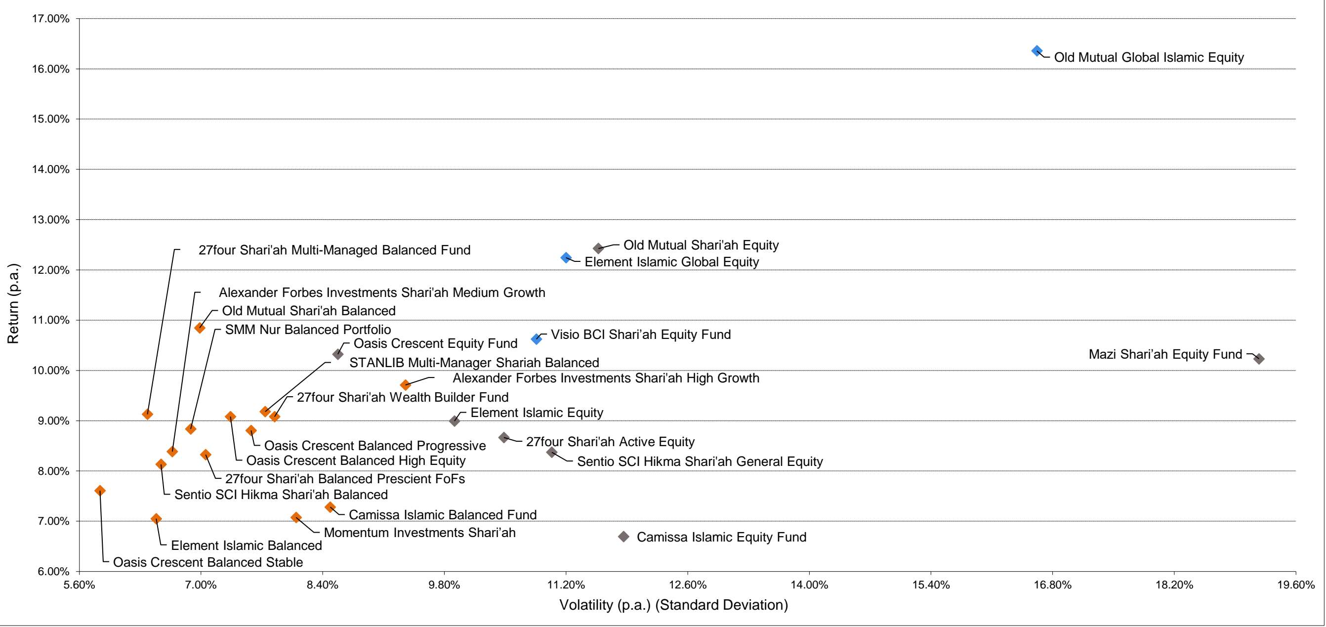
Risk vs Return Scatterplot on Shari'ah Compliant Portfolios - Balanced and Equity mandates 3 Years ended 30 September 2024